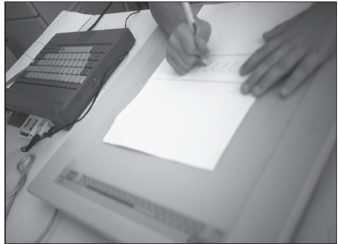
Figure 1. Computerized Penmanship Evaluation Tool (CompPET), including laptop computer, digitizer, and evaluation software.

Displacement, pressure, and pen tip angle were sampled at 100 Hz by means of a 1300 MHz Pentium M® laptop computer. The CompPET system analyzes each writing segment. The primary outcome measures consisted of temporal,